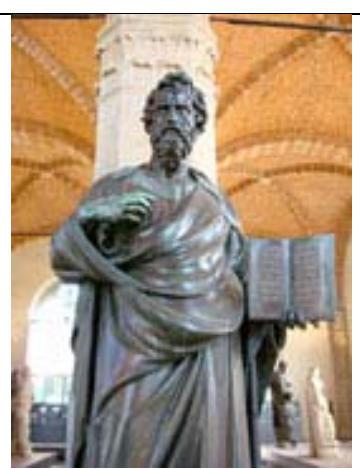
Ghiberti, Saint Matthew, http://www.museumsinflorence.com/musei/orsan michele.html