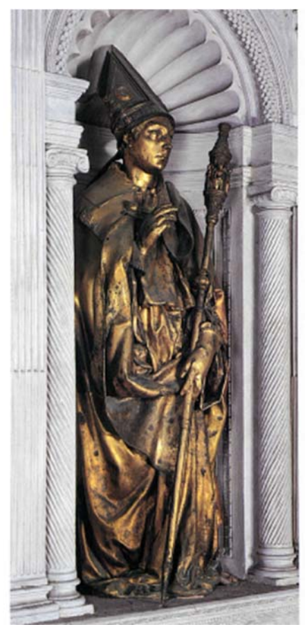
Figure 3: Donatello's Saint Louis of Toulouse , Santa Croce Opera Museum.

Completion of the Parte Guelfa's tabernacle came rather late in the process of filling the exterior niches of Orsanmichele. The organization's contribution of Saint Louis of Toulouse , carved by Donatello, was completed around 1420—shortly after the ten-year deadline established by the confraternity for filling or forfeiting the niches, and coinciding with an ultimately unsuccessful Parte campaign to revive its political role in governing the city.<sup>50</sup>