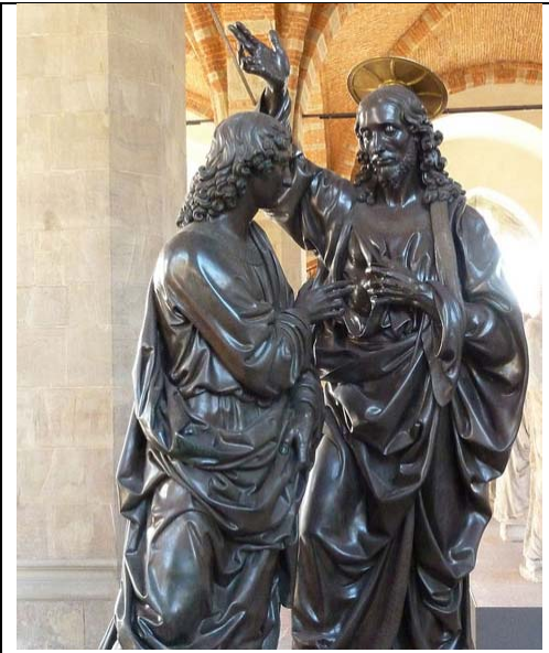
Verrocchio, Christ and Saint Thomas, <a href="http://www.museumsinflorence.com/musei/orsanmichele.html">http://www.museumsinflorence.com/musei/orsanmichele.html</a>