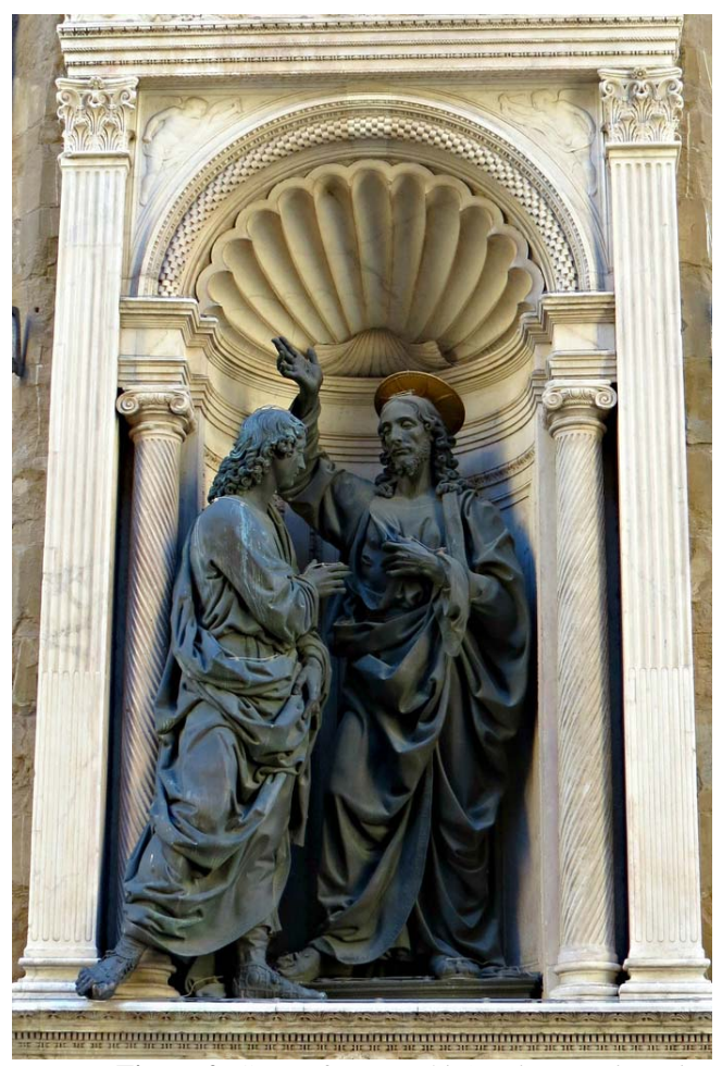
Figure 2. Copy of Verrocchio's Christ and Doubting Thomas , Orsanmichele.

One of the last significant changes to the outside of Orsanmichele took place years after the period that most scholars consider when discussing the monument. Yet this change beautifully illustrates the continuing value of this civic center in portraying important messages of political rhetoric.