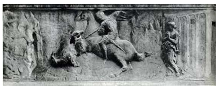
Figure 1: Predella beneath Nanni di Banco's Four Crowned Martyrs and Donatello's Saint George .

same plane. Yet when you look at Donatello's relief for Saint George , you see depth and sense movement and see how the background is brought into the scene through the dimensionality created by this new technique. The difference is quite striking, and is believed to be the first time a sculptor achieved the concept of perspective, using relievo schiacciato in sculpture.<sup>42</sup> Rosenauer makes a compelling case that this advance occurred at Orsanmichele because the paintings inside the building challenged the sculptors to innovate in order to match the advances that were happening in paintings.<sup>43</sup>