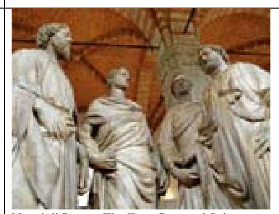
Nanni di Banco, The Four Crowned Saints, <a href="http://www.museumsinflorence.com/musei/orsanmichele.html">http://www.museumsinflorence.com/musei/orsanmichele.html</a>